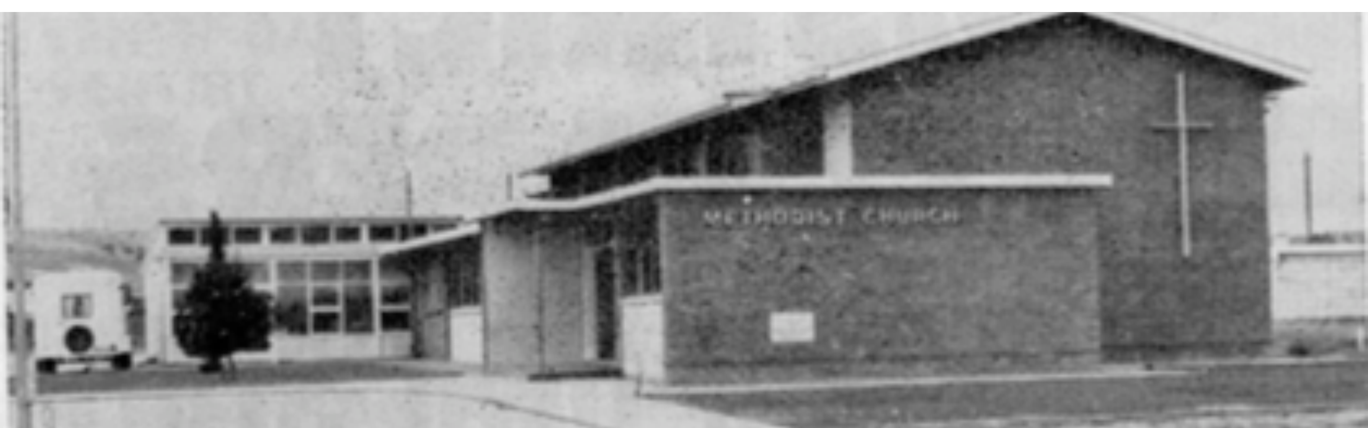
Elizabeth Methodist Church on Fairfield Road, Elizabeth