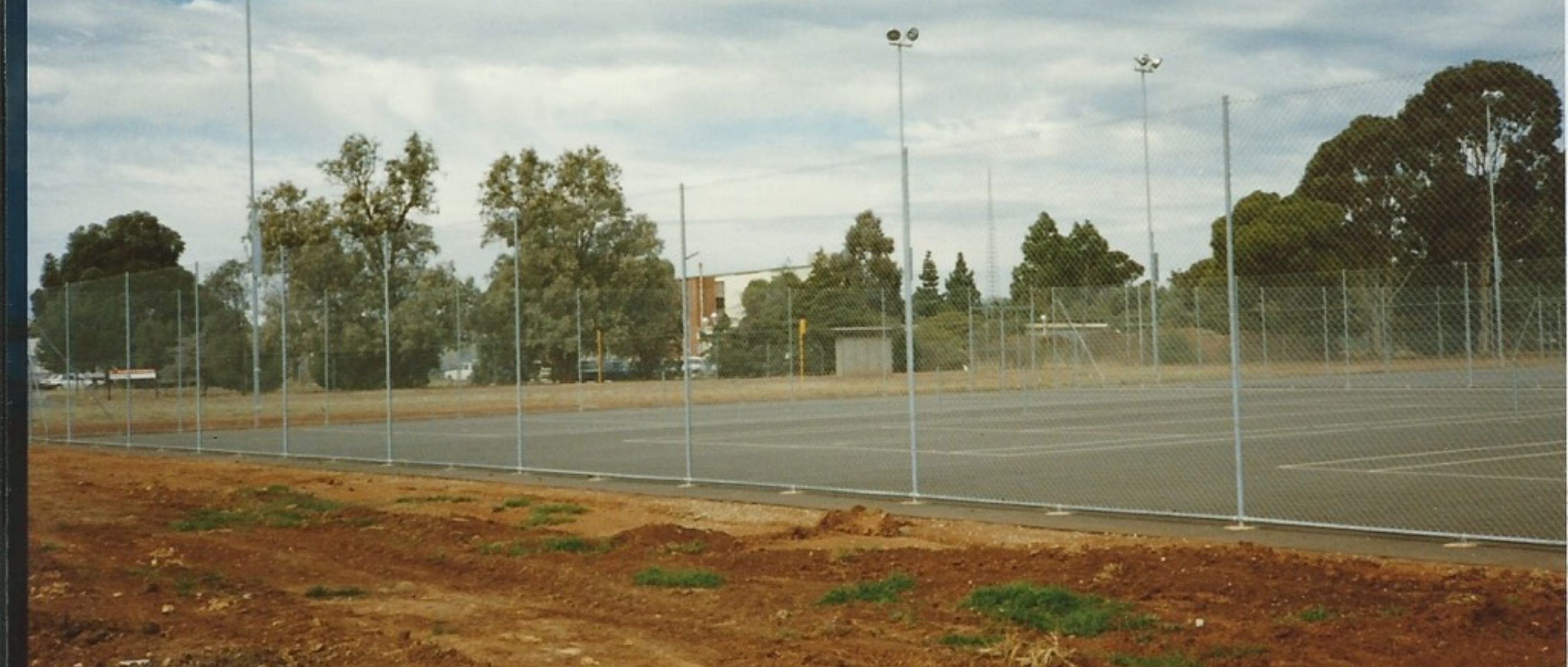
Photo of the original bitumen courts built at the BTC