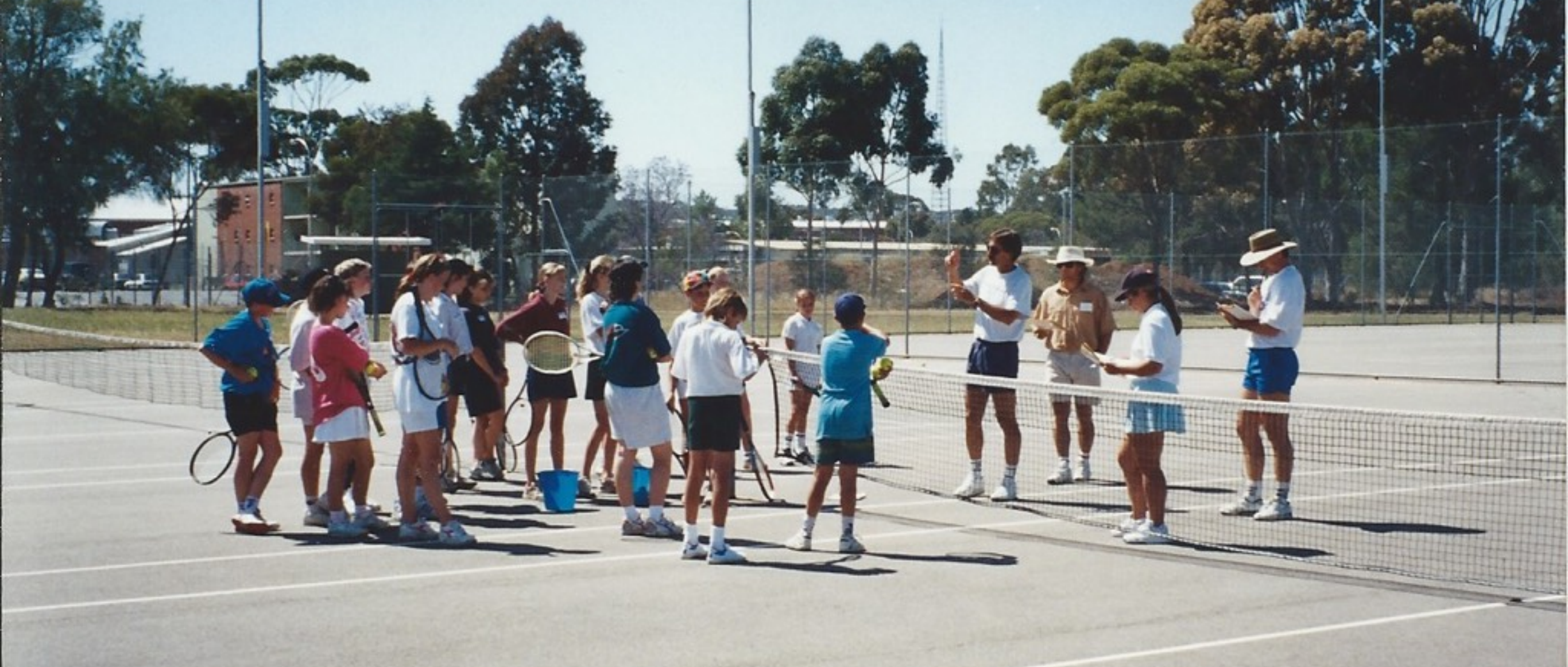
1994 Juniors taking instruction at the BTC