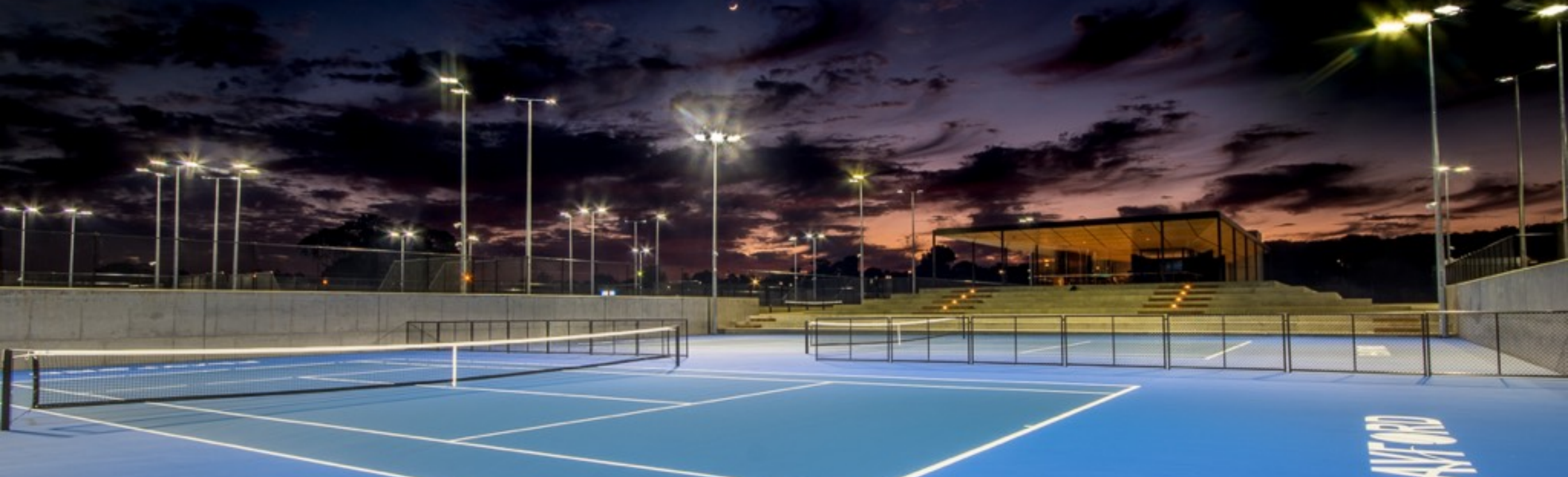
View from show courts of the PCTC clubhouse and courts