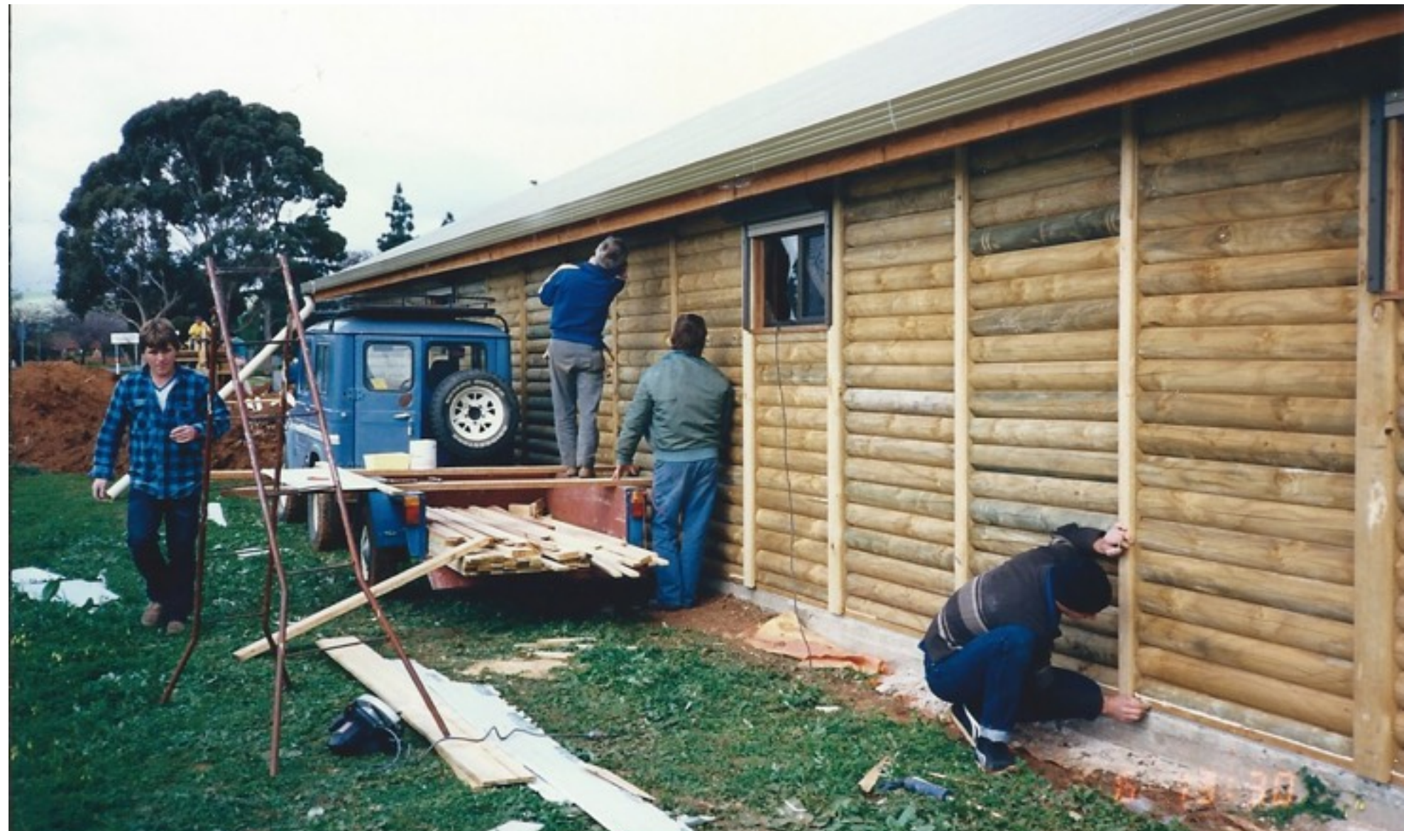
Members of the Association building the BTC. View is of the rear of the building

Construction was a co-operative venture. Pine Line Homes provided 2 tradesmen for two weekends, to assist with the construction of the walls and roof trusses. Members of affiliated clubs provided the bulk of the effort and additional support came from people performing